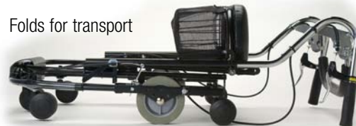
Folds for transport